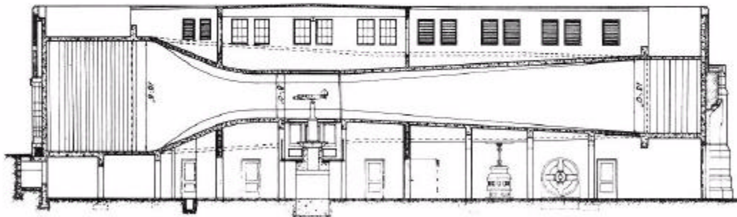
SECTIONAL ELEVATION "C"